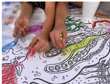
Lots of creative energy goes into the transformation of the giant mural!