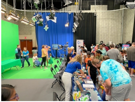
Children, with parents in tow, searched for Daniel Tiger, and took a moment in front of the green screen to "be on TV".